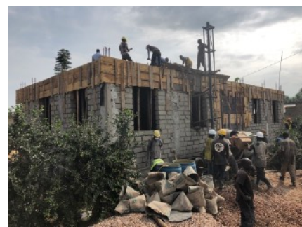
Building construction progress

This third floor will cost about $25,000. We are so thankful that God has already provided $5,000. Unfortunately, this is not a project that can be stopped in the middle. It needs to be completed as a whole. Please pray that God will help us finish this building to be a good steward of the present and future needs.