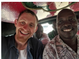
Riding in a matatu with two pastors