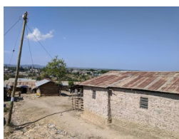
Looking out from Mkindani Baptist Church