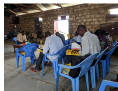
Bible College class