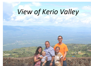
View of Kerio Valley