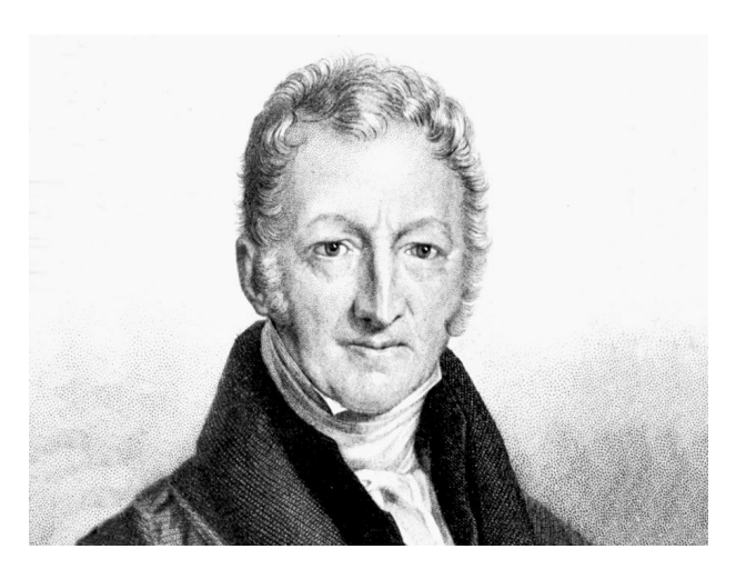
Thomas Malthus FRS 1766 – 1834 Mentor for the Fake Greens

not – this plan for global tyranny has already been laid out in the United Nations' Agenda 21 which, in turn, has now been upgraded and updated into UN Agenda 2030 for 'transforming the world' by fully embracing 'sustainable development'.