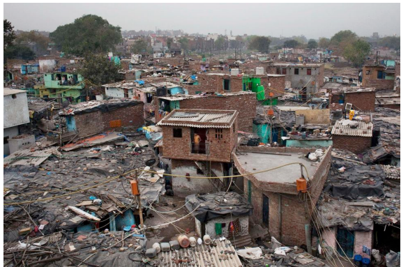
The world that we allow because of our ignorance about the existence of the globalist deep state

It is now time for the Real Greens to assert ourselves and to take back the true green narrative. It is also time for all of us, the ordinary people – people who just want to see the pursuit of truth, justice and compassion, not to mention the use of sane and human-scale economics and the common-sense nurturing of the world's ecosystems – to come together and so prevail over these globalist ambitions of this malicious and controlling Deep State. Such an impetus to mobilise the truth would also provide the ideal opportunity for genuine scientists to then feel unfettered and safe enough to explain and explore the deliberately suppressed but proven solutions and technologies that are now so desperately needed by all the peoples of the world.