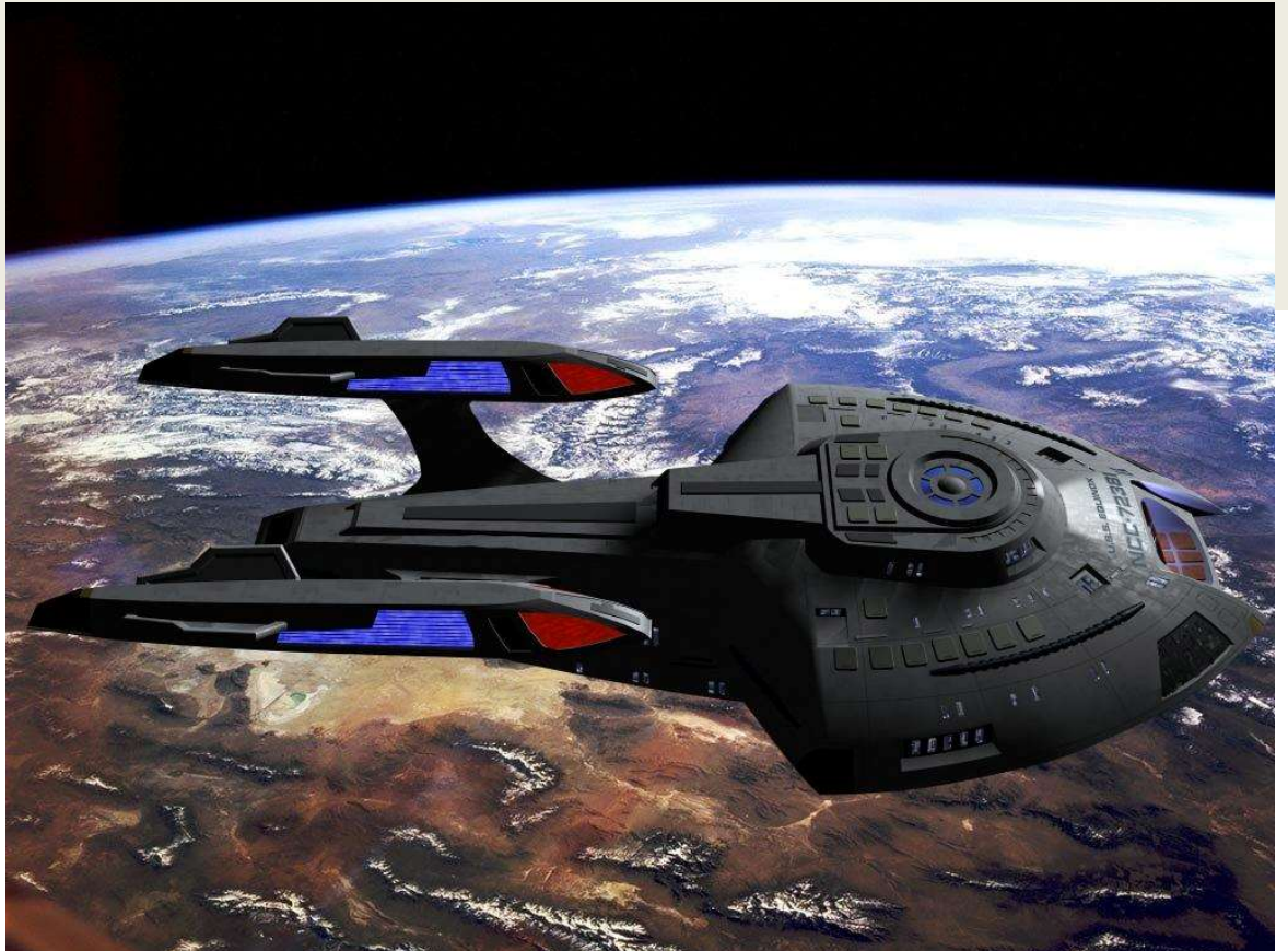
NOVA CLASS STARSHIP as it orbits the Planet

Never forget the most important rule of being in a fan group.....HAVE FUN! Additionally, you will get out of this organization, what you put into it! So welcome aboard.