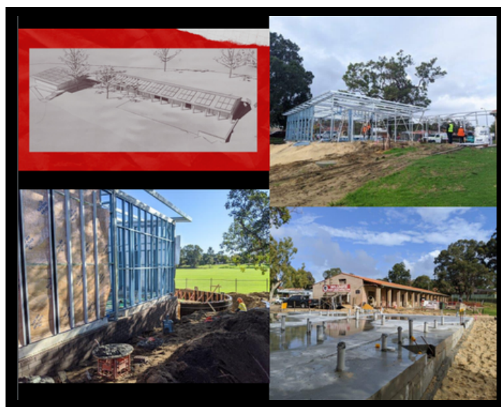
Willagee Club Refurbishment

With our Premiership & Val Murphy Grades unfortunately pulling out for the season, we have our Women's Tackle and Women's League Tag players to look forward to see playing, as well as our Juniors of 13 teams.