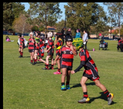
12/07/2020 Game Day