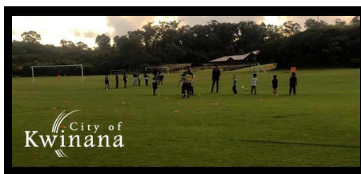
First training at Thomas Oval, Medina

TAKE A PEEK AT WHAT'S INSIDE: Get to know the Volunteers! - pg 5