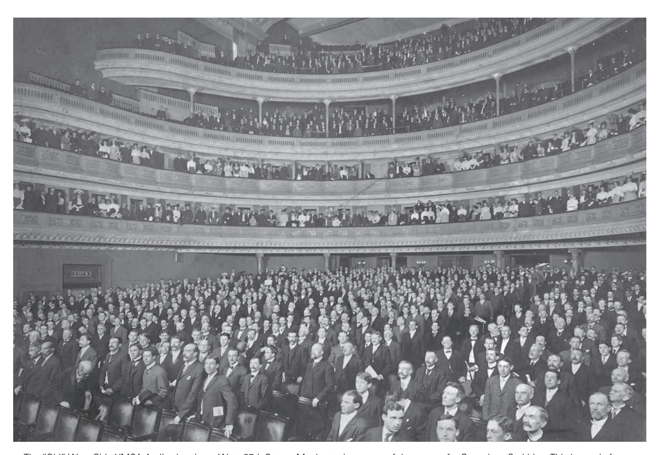
The "Old" West Side YMCA Auditorium (near West 87th Street, Manhattan) was one of the venues for Genevieve Stebbins. This image is from an unknown event, but illustrates that Stebbins would perform in a large space such as this.

sarte and Ling Gymnastic methods had much in common, even though they emphasized different aspects of physical development. Ling's interest in the relationship between thought and action had its parallel in the Delsartean correspondence between body and mind [...] She believed that, even though Ling had concentrated on the purely physical, he was always aware of its mental and moral applications. Delsarte, in contrast, had focused on expression without the knowledge of the physical possessed by Ling, Thus, together the two systems complemented each other (Wilbor 1892: 181, quoted in Ruyter 1999: 95).