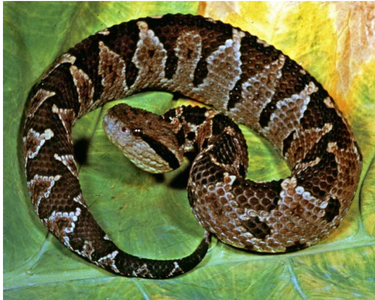
Curlew and viper