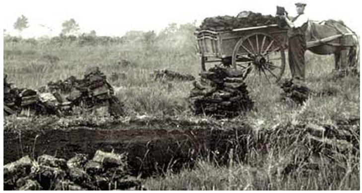
Heather and peat cutting