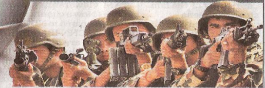
Nepal's soldiers marking Army Day last week

When the Maoists abandoned the broad swathes of the country they controlled during the civil war and arrived in Kathmandu, Nepal seemed to have conquered its troubles. Not at all. Now the Maoists, in government for the first time, are locked in a different battle - with the national army. They want their armed cadres to be inducted into the military. But the army chief is blocking the move as he is wary of the armed Maoist cadres' political ideology. The friction is ominous as restless Maoist cadres talk of another revolution and the government fails to deliver on the promises it made during the civil war. Meanwhile, the government plans a long-term friendship treaty with China as a bailout insurance plan, ahead of prime minister Pushpa Kumar Dahal's visit to Beijing. Not a good sign for India.