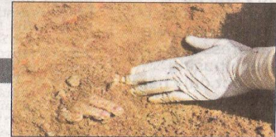
A body being uncovered from a mass grave inside the BDR headquarters in Dhaka on Saturday

war. In his maiden tour of South Asia in 2000, US President Bill Clinton made it a point to visit Dhaka for a day. It was a point well made. It was the time Bangladesh was being praised by the world as a Muslim-majority country with a flourishing Western-style democracy. It was receiving plaudits for other attributes as well: a vibrant civil society, NGO success stories, the micro-credit revolution. And it was in focus for the untapped reserves of gas under its impoverished land. The gas represented the future and wealth that could have changed the face of the nation. But the 'mutiny' appears to have taken Bangladesh back in time, to an earlier century. Almost every other indicator coming out of the country is bleak: rising poverty, growing religious fundamentalism, faltering institutions and a restless army. To many, Bangladesh is the perfect example of a state on the verge of collapse, if not failed already.