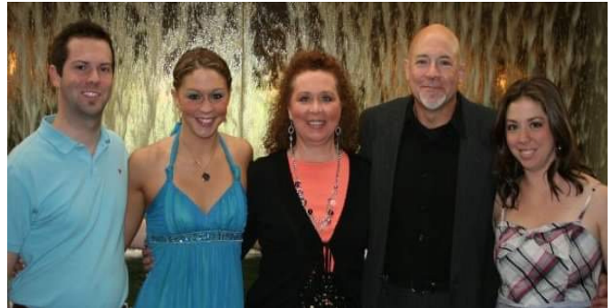
Prayer over Memorial Baptist Church