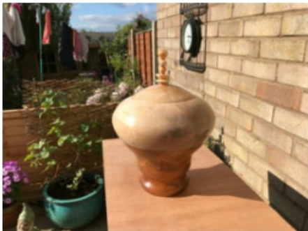
Above and Right: