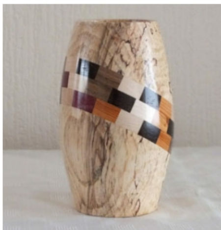
VASE 165mm high x 100mm dia.

Wood sp.beech with segmented feature ring■