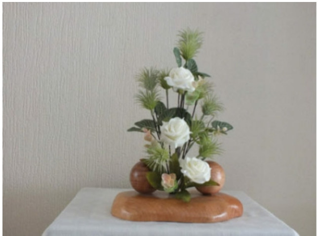
Flower arrangement on a wood base