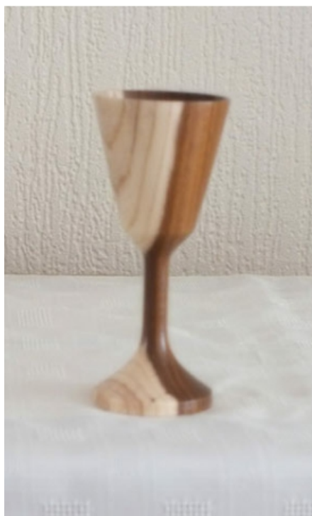
GOBLET 135 mm high x 60mm dia.