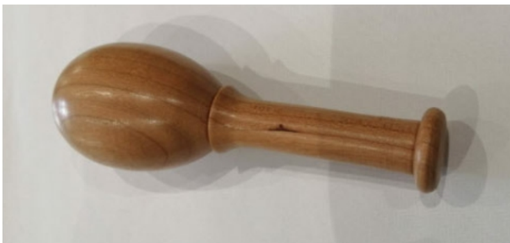
Darning Egg in Beech