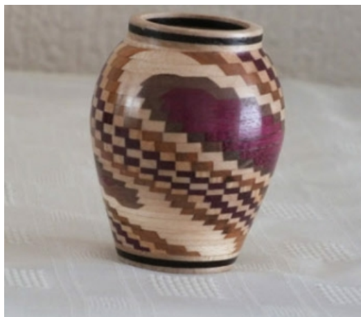
SEG. VASE 65 mm x 50mm dia