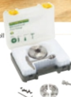
SC4 Professional Geared Scroll Chuck Package