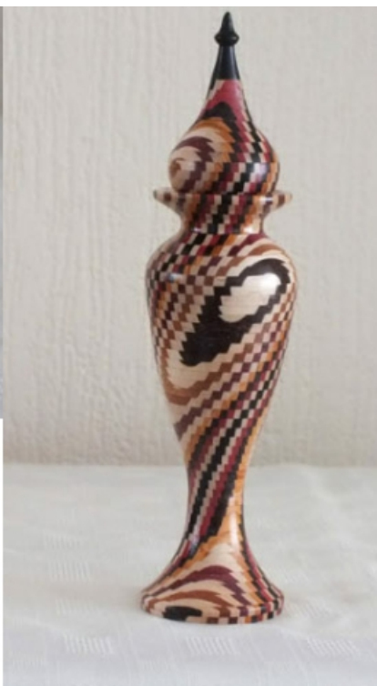
LIDDED SEG. PIECE 240mm high X 65mm dia