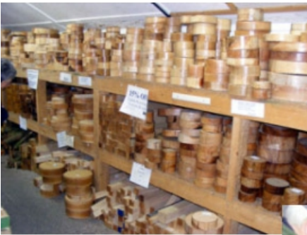
Above & Right: Just a small part of the vast range of timbers available at Yandles.