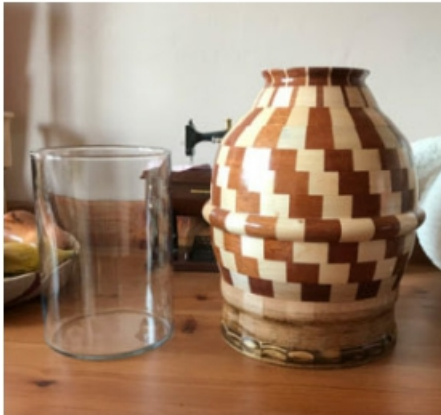
Closed segment Vase