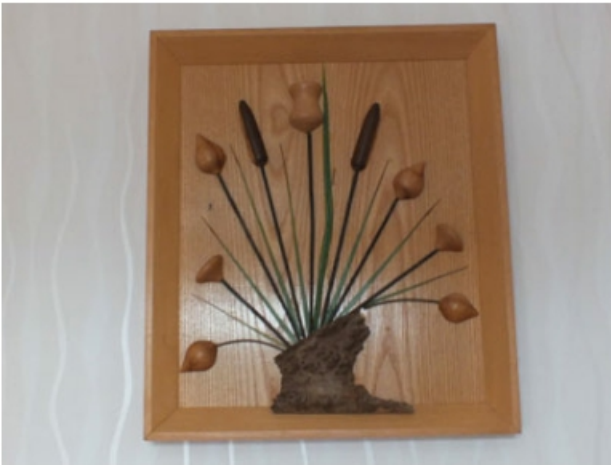
WOOD FLOWER PICTURE 500mm x 500mm