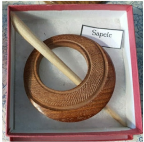
A finished ornament complete with scarf pin.