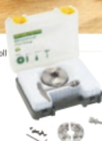
SC4 Professional Geared Scroll Chuck Package