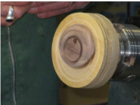
Some turning has now taken place