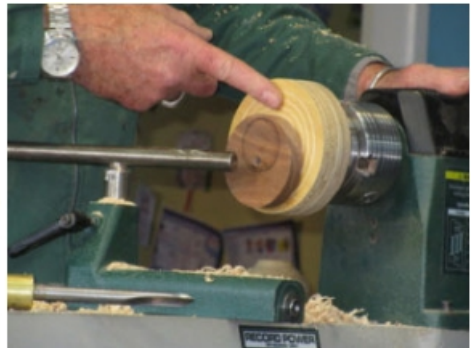
The concentric marks on the glue chuck aids the positioning of the brooch