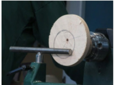
These three pictures show the bowl in progress.

Next was an off centre bowl using a similar method of mounting to the last piece. Again the pictures will show the procedure followed.