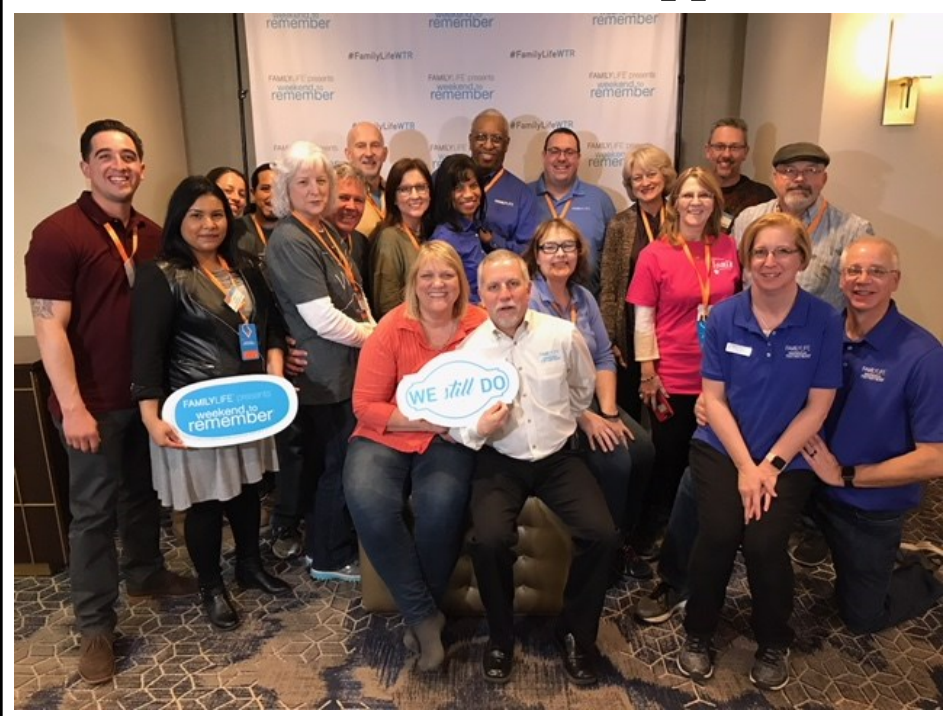
The Chicago Weekend to Remember Volunteer team at this year's getaway.