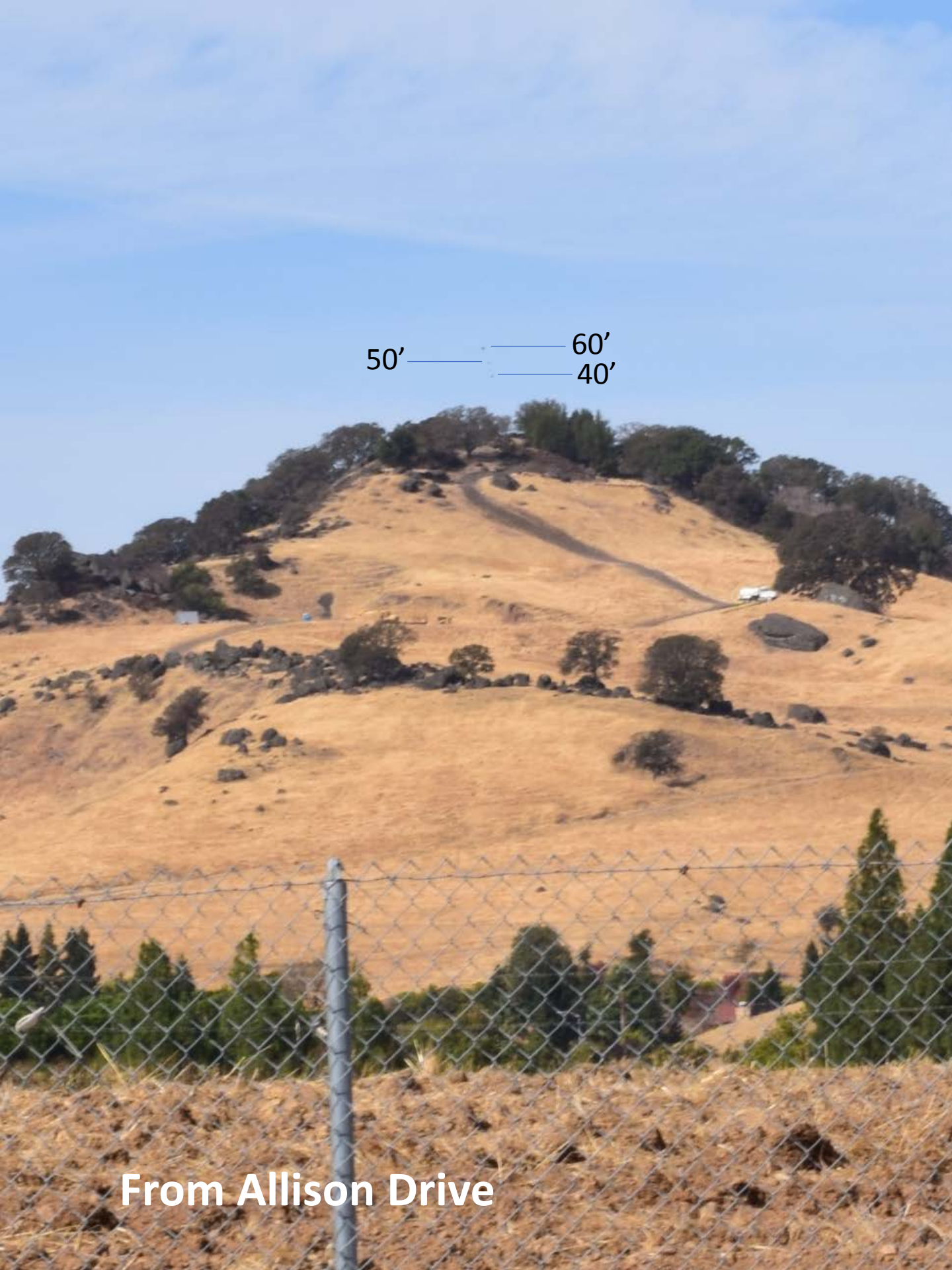
From Allison Drive