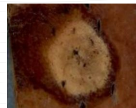
International RF Ablation Brand Liver Ablation