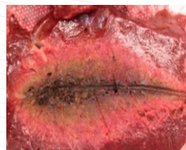
Conventional RF Ablation Brand Liver Ablation