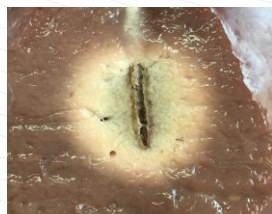
Dophi™ RF Ablation System (19G)Liver Ablation