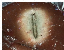
Dophi™ RF Ablation System (17G)Liver Ablation