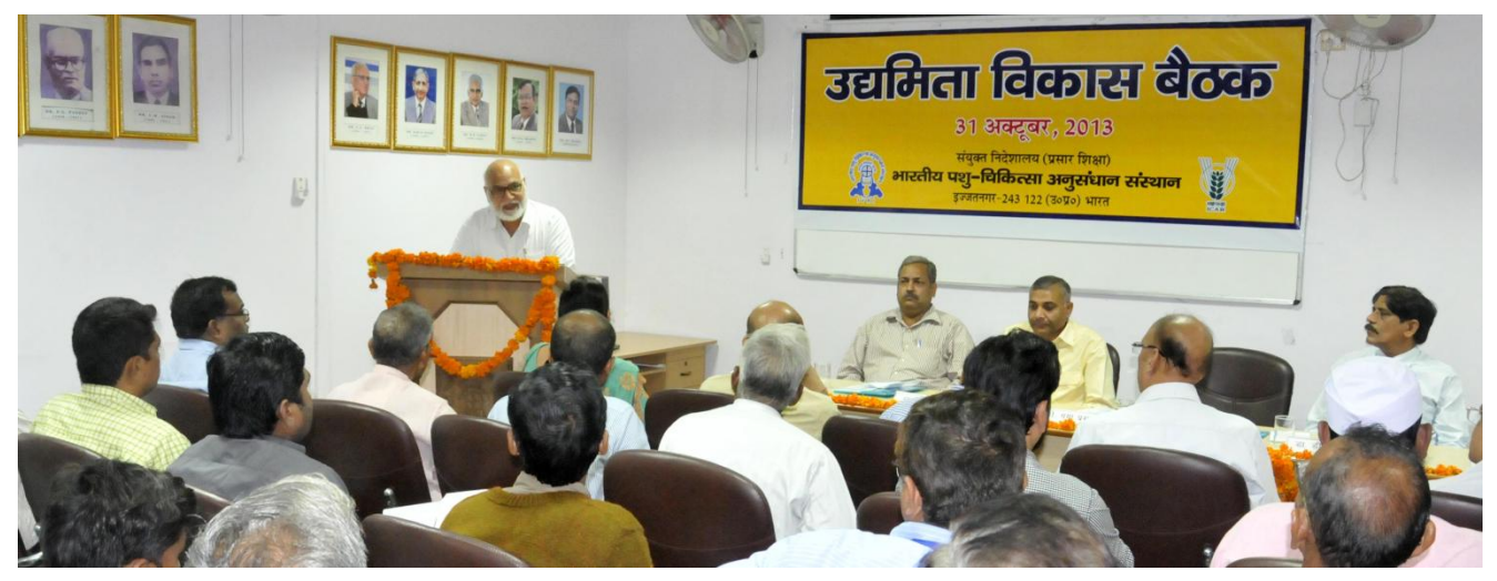
Entrepreneurship meet organised at IVRI for the progressive farmers & entrepreneurs of Uttar Pradesh & Uttarakhand (2013)

The entrepreneurial farmers are being felicitated and honoured by agricultural universities and research institutions and agricultural development agencies on different occasions like farmers' fairs (http://www.icar.org.in/en/node/10275). Almost all the SAUs, ICAR institutes and KVKs in India have list of enterprising farmers whom these institutions not only have awarded but a few of them utilize their services as resources persons too. The ICAR honours innovative farmers including agripreneurs under different categories every year on its Foundation Day on July 16. The farm magazines, radio, TV and YouTube videos profiling enterprising farmers have become very common in recent times (https://www.youtube.com/watch?v=7MmdNNfON0Y&spfreload=5).